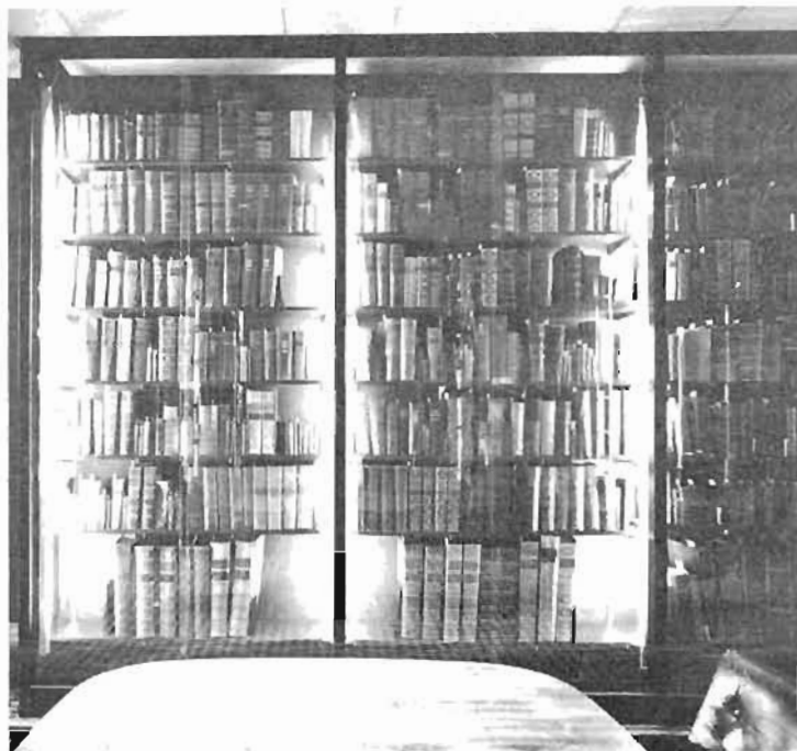
The more than 200 different editions of Samuel Johnson's Dictionary in the Cordell Collection.