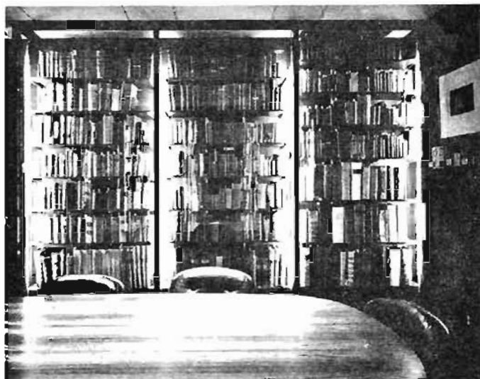
MAIN READING ROOM: Portion of the Foreign Language Dictionary holdings.