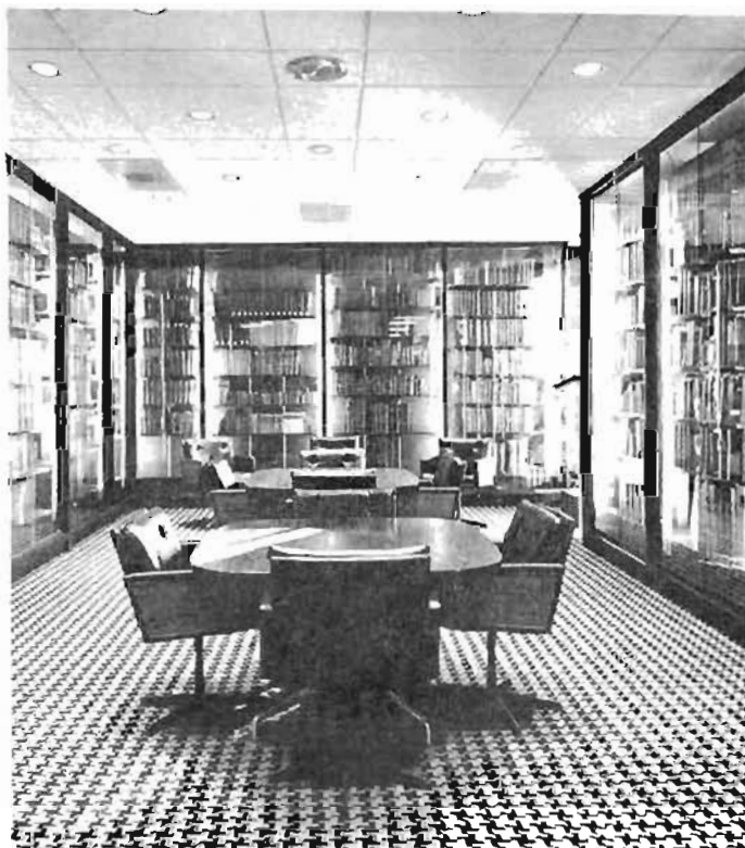
THE CORDELL ROOM: Portion of the English Language Dictionary holdings.